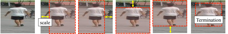
(a) Input image (b) Attending actions (Each red dotted box represents the attention window after the action) Figure 3: Identity discriminative attending actions are given by an attending scale variable on four directions (left/right/top/bottom). Termination action means the stop of a recursive attending process.

[60] . Formally, we aim to learn an optimal state-value function which measures the maximum sum of the current reward ( R_t ) and all the future rewards ( R_{t+1}, R_{t+2}, \dots ) discounted by a factor \gamma at each time step t :