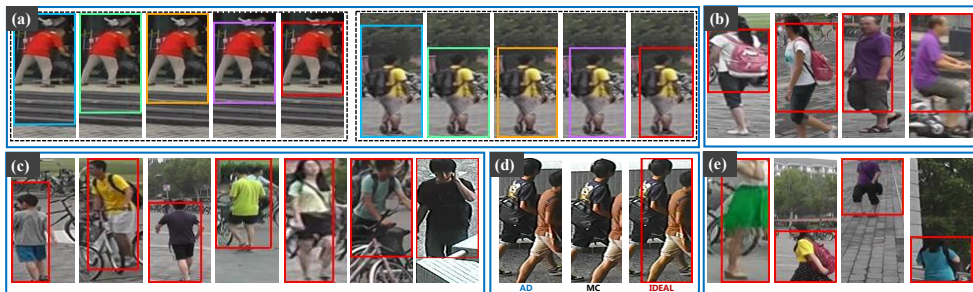
Figure 4: Qualitative evaluations of the IDEAL model: (a) Two examples of action sequence for attention selection given by action 1 (Blue), action 2 (Green), action 3 (Yellow), action 4 (Purple), action 5 (Red); (b) Two examples of cross-view IDEAL selection for re-id; (c) Seven examples of IDEAL selection given by 5, 3, 5, 5, 4, 2, and 2 action steps respectively; (d) A failure case when the original auto-detected (AD) bounding box contains two people, manually cropped (MC) gives a more accurate box whilst IDEAL attention selection fails to reduce the distraction; (e) Four examples of IDEAL selection on the Market-1501 “distractors” with significantly poorer auto-detected bounding boxes when IDEAL shows greater effects.