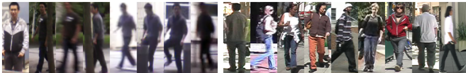
Fig. 1. Illustrating key differences in person detection quality when automatically detected from mobile re-identification platform video (MRP, left), compared to detections in a standard re-identification dataset, VIPeR (right). Notably, the VIPeR images (i) are in perfect register, (ii) feature standard walking poses from a limited number of relative angles. Contrastingly, the MRP images are unregistered, feature more varied pose and also occasionally heavy motion-blur because of the relative motion of the MRP to the target person during transit.

tified tasks; (iv) We elucidate the unique challenges posed by MRP re-id and discuss their implications for general re-id research going forward.