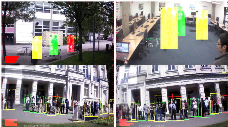
Fig. 3. Screen captures from our mobile re-identification platform’s data capture sessions; illustrating real-time person detections colour-coded by detection confidence. The top-left and top-right images illustrate typical operator views from the outdoor and indoor flights from Dataset 1; The bottom row illustrates Dataset 2.

ensemble of local features [12] (ELF), which encodes both color and texture in 6 horizontal strips [25] for final features of 2784 dimensions.